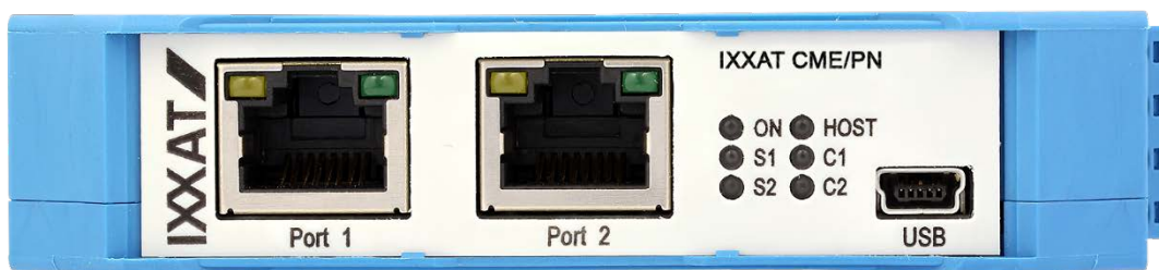
Figure 3-4: Displays of the IXXAT CME/PN

The IXXAT CME/PN has six LEDs. These LEDs are used to display the communication status of the associated interfaces and/or to display the device status. The RJ45 connectors also each have two LEDs that display the link status of the corresponding Ethernet port.