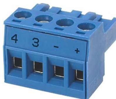
Figure 3-2: Power plug for the IXXAT CME/PN

A screw terminal is used to connect the IXXAT CME/PN to a power supply. For the cabling, it is important for the cables to have a sufficient cross section ( >0.14\text{mm}^2 ). The pinout of the screw terminal is shown in Table 3-1.