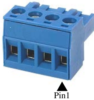
Figure 3-3: CAN connection terminal for the IXXAT CME/PN